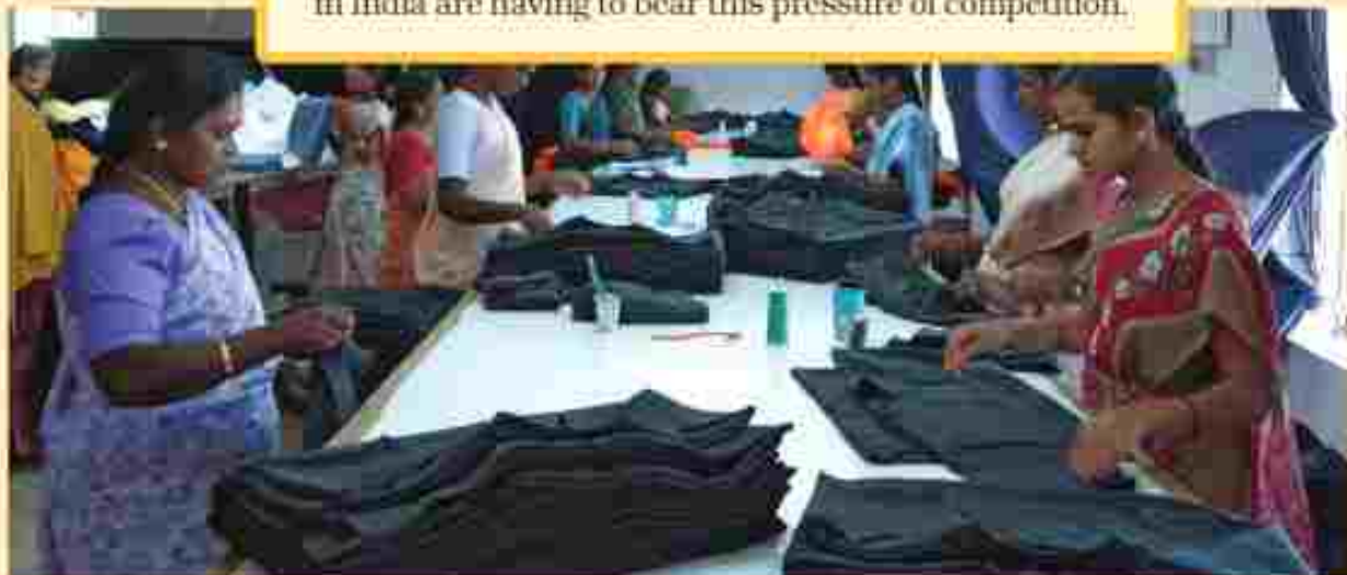
Factory workers folding garments for export. Though globalisation has created opportunities for paid work for women, the condition of employment shows that women are denied their fair share of benefits.

Let us see how the workers in the garment export industry in India are having to bear this pressure of competition.