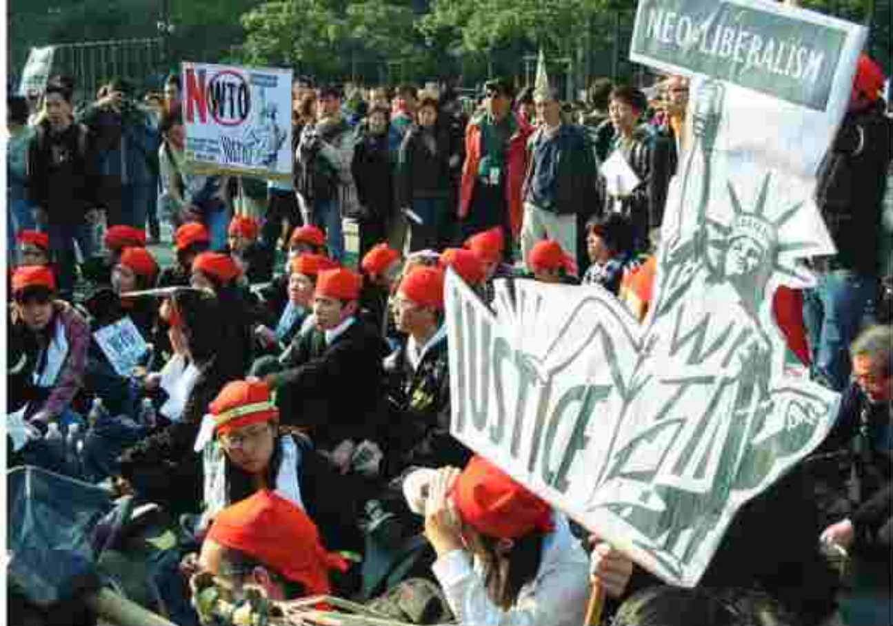
A demonstration against WTO in Hong Kong, 2005