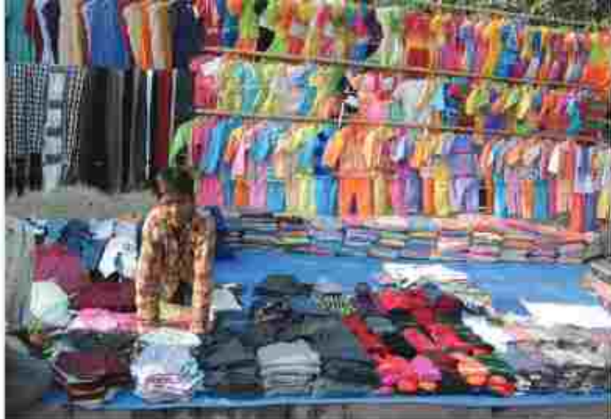
Small traders of readymade garments facing stiff competition from both the MNC brands and imports.

In general, with the opening of trade, goods travel from one market to another. Choice of goods in the markets rises. Prices of similar goods in the two markets tend to become equal. And, producers in the two countries now closely compete against each other even though they are separated by thousands of miles! Foreign trade thus results in connecting the markets or integration of markets in different countries.