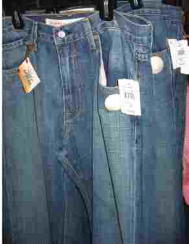
Jeans produced in developing countries being sold in USA for Rs. 6500 ($145)

There's another way in which MNCs control production. Large MNCs in developed countries place orders for production with small producers. Garments, footwear, sports items are examples of industries where production is carried out by a large number of small producers around the world.