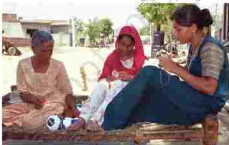
Women at home in Ludhiana making footballs for large MNCs

Thus, we see that there are a variety of ways in which the MNCs are spreading their production and interacting with local producers in various countries across the globe. By setting up partnerships with local companies, by using the local companies for supplies, by closely competing with the local companies or buying them up, MNCs are exerting a strong influence on production at these distant locations. As a result, production in these widely dispersed locations is getting interlinked.